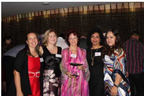
With the Committee